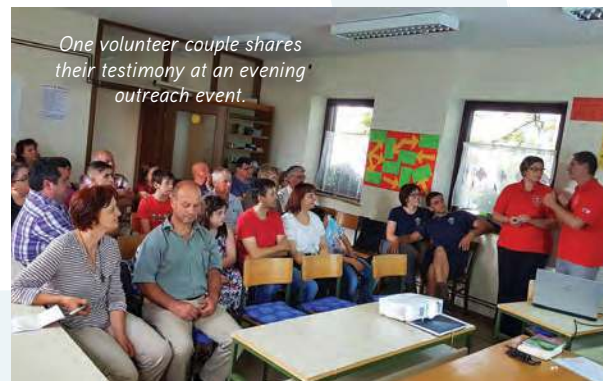
One volunteer couple shares their testimony at an evening outreach event.

making the trip, in 2014 God used their dream of walking the Camino to give birth to a new idea—the start of a similar prayer walk in Slovenia. That year they took 13 days out of their schedule to walk 257 kilometers (approximately 160 miles) from city to city visiting HomeBuilders® groups, praying for the ministry, and fellowshiping with volunteer couples. That walk became an annual event: the Family and Life Slovenia Prayer Walk for Families. Many HomeBuilders groups throughout the country have gotten involved, either by